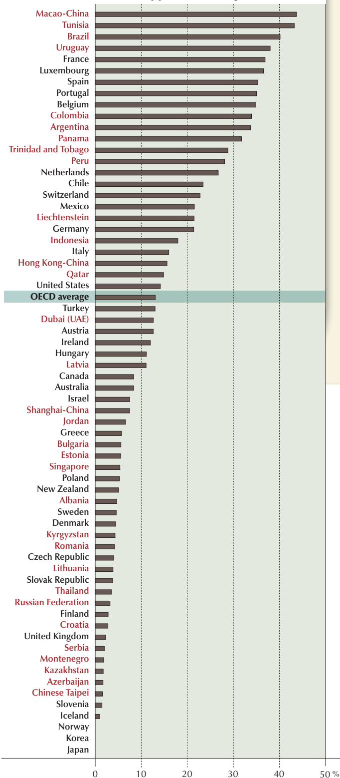
Percentage of students reporting that they have repeated a grade at least once in primary, lower secondary or upper secondary school...