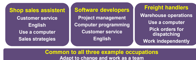
FIGURE 2: SKILLS MOST MENTIONED IN VACANCY POSTINGS FOR THREE OCCUPATIONS

vacancies Cedefop analysed. In two out of three, being able to work in a team is among the skills requested by employers.