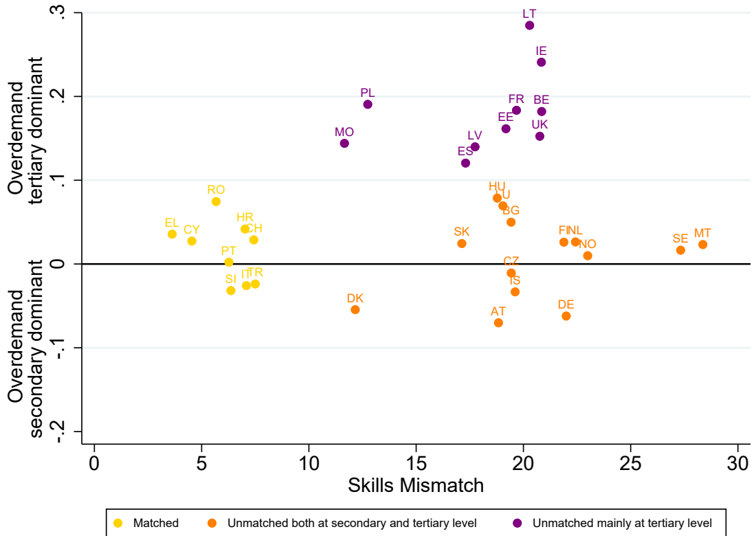
Figure 3: Taxonomy of skills mismatch

Notes: this graph reports on the x-axis the countries' average Skills Mismatch Rate over the period 2006-2016. The y-axis indicates whether the overdemand of tertiary educated workers is larger than the overdemand of secondary educated ( y > 0 ) or vice versa the overdemand of secondary educated workers dominates the ones of tertiary educated workers ( y < 0 ). Overdemand occurs when the share of employment with education k is larger than the share in unemployment with the same education k . Secondary education corresponds to ISCED 3-4, while tertiary to ISCED 5-8. An example of interpretation of the graph is the following: Iceland and Estonia shows an almost identical level of Skills Mismatch Rate. However, while in Iceland the mismatch is equally driven by an overdemand of secondary and tertiary educated worker, in the case of Estonia the mismatch is mainly driven by an overdemand of tertiary educated workers, which dominates the overdemand of secondary educated workers.